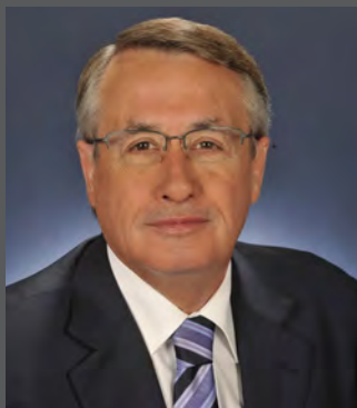
WAYNE SWAN MP Former Deputy Prime Minister and Treasurer