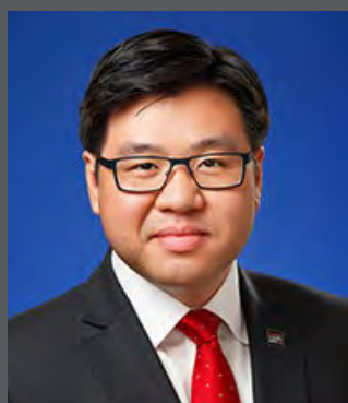
DR TIM SOUTPHOMMASANE Australian Race Discrimination Commissioner