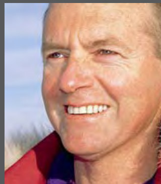
GRAEME JOY Expedition Leader and First Australian to ski to the North Pole