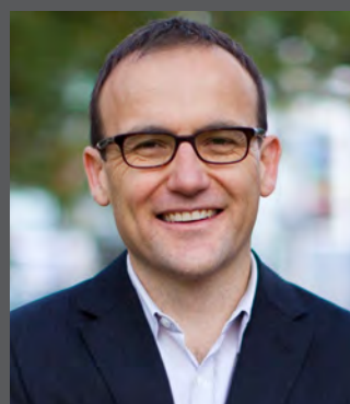
ADAM BANDT MP Federal Member for Melbourne