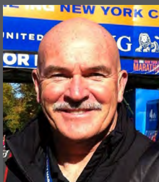
ROBERT DE CASTELLA Marathon Runner and founder of the Indigenous Marathon Project